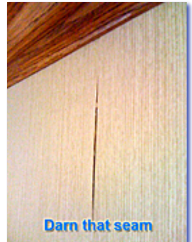
Darn that seam

Drop the probes (the toothpick or bamboo skewer) in warm water. You want the probes to be moist and softer than when they are dry. This softness transfers some moisture to the underside of the wall covering while you open the loose seams. The probes point softness is also important so it doesn't penetrate or injure the covering.